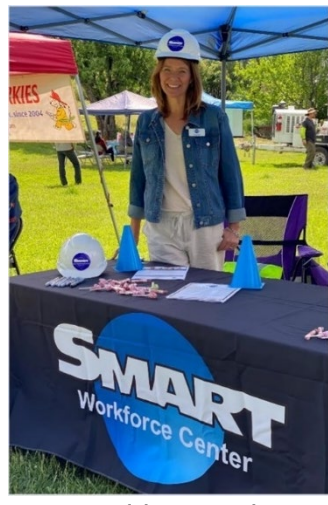
SMART at Trinity County Fire Preparedness Day