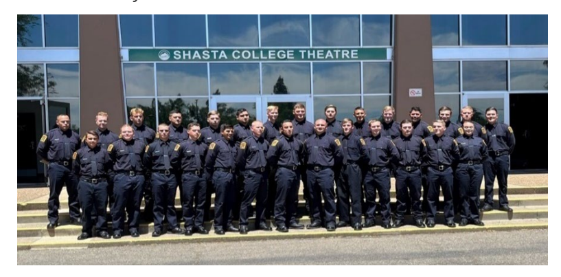
Shasta College Fire Academy Grads, several of which were assisted by SMART, and went on to be hired by CalFire

Inspired by our front-page article, SMART hopes you enjoy some of the images from around the North state, where SMART has helped assist fire readiness and fire recovery efforts.