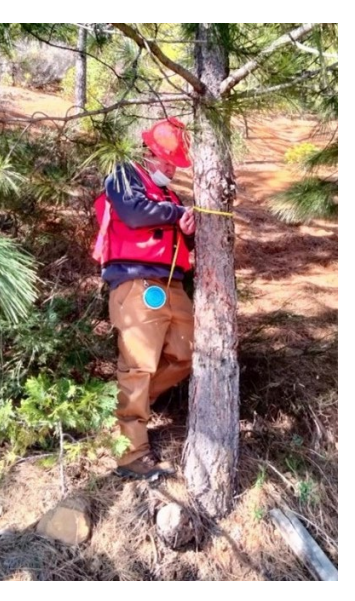
SMART trainee at Black Fox Forest Tech training in Siskiyou County

SMART Workforce Center is a 501c3 non-profit, committed to helping job seekers find jobs, increase training and skills, and increase earnings. We also invest in our local economy by helping businesses grow. Proudly serving our community since 1979, we have invested over $60 million into serving our clients, businesses and communities. SMART is an equal opportunity employer. Auxiliary aids services are available to individuals with disabilities. TTY 711 relay