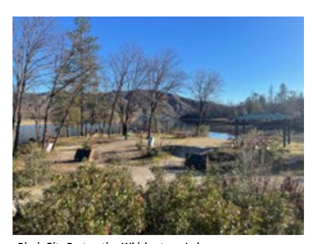
Picnic Site Restoration Whiskeytown Lake Funded in part by SMART managed NDWG Grant