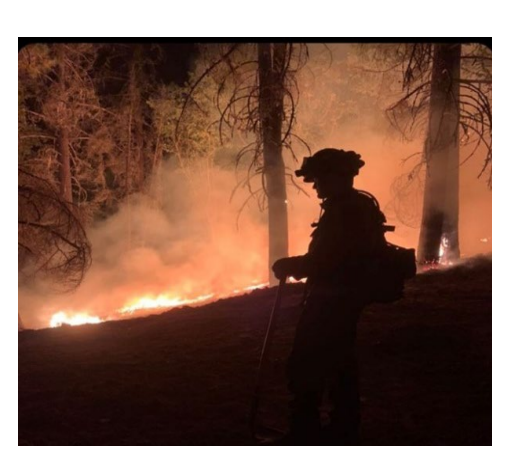
This is a SMART sponsored Shasta College Fire Academy grad on the fire lines this year