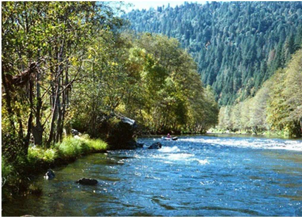
TRINITY COUNTY EDITION