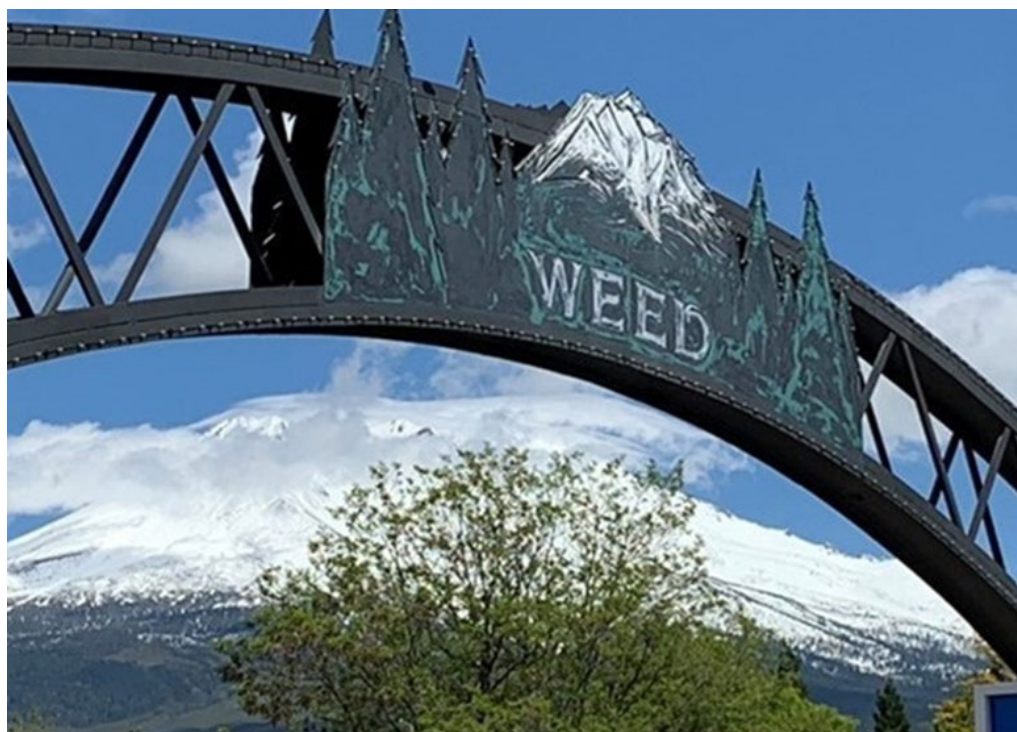
SISKIYOU COUNTY EDITION