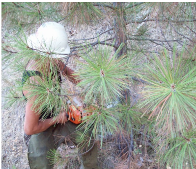
Western Shasta RCD