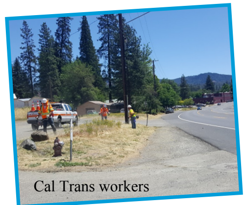
Cal Trans workers