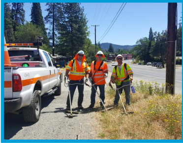
Cal Trans Workers

Smart Center received funds to assist public or private non-profit facilities affected by the winter storms of 2016-2017. Temporary jobs are available for participants; they will be performing clean-up and repair due to storm damage. 9 individuals are currently placed at Cal Trans, City of Redding, or Trinity County Watershed. Six more people will start in July at the City of Redding. At left are CalTrans workers. They clean up invasive species, clear defensible space, and repair damaged vegetation & irrigation.