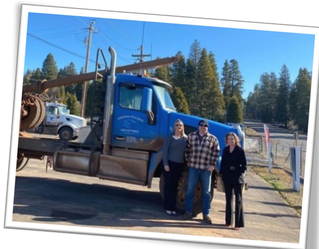
Sierra Pacific, partners with SMART and Shasta College.

SMART is excited for our partners, Sierra Pacific Industries, on their expansion and beautiful new sawmill in Burney, California. Their community investment has created new opportunities for great careers in that area. An increased need for truck drivers created a collaboration with another of our partners, Shasta College, to create a Class A & B License training at the Intermountain (Burney) Shasta College campus. Classes started 1/14. In just 18 weeks, students can be ready to embark on this well-paying and growing career path.