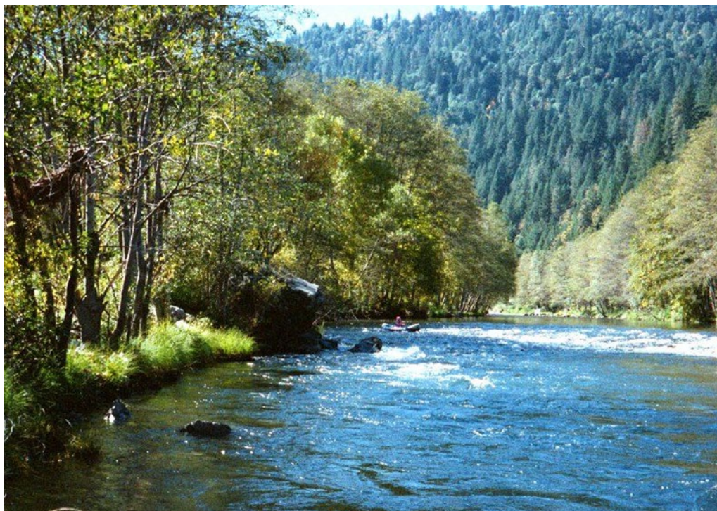
TRINITY COUNTY EDITION