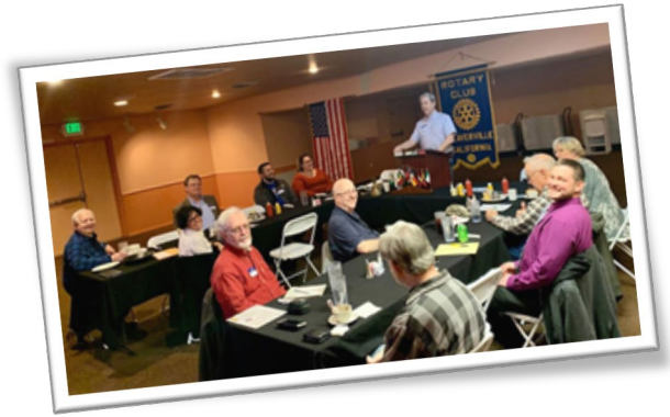
SMART at the Rotary

Watershed Research and Training Center, Trinity County Office of Education, and Trinity County Health and Human Services. We are looking forward to building strong and lasting partnerships!