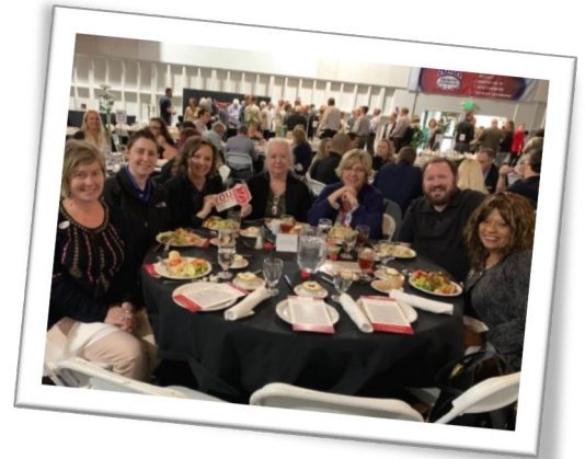
SMART at Simpson University

motivational speaker, and entrepreneur. He gave many nuggets of wisdom, but among our favorite was: "Life is short and you never know what tomorrow will bring - don't wait to pursue your dreams."